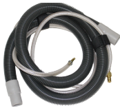
TOOL & HOSE ACCESSORY BAG (SC7 & SC12) FX1049AC