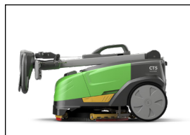
FOLDABLE HANDLE FOR STORAGE AND TRANSPORTING