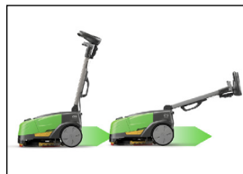
REVERSE DRYING SYSTEM