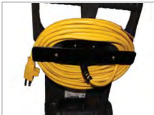
BUILT IN CORD STORAGE