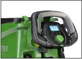
FULL MACHINE CONTROL DUE TO INTUITIVE CENTRAL DIAL