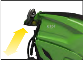
ADJUSTABLE HANDLE FOR COMFORTABLE AND EASY USE