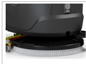
SPIN-ON, SPIN-OFF BRUSH